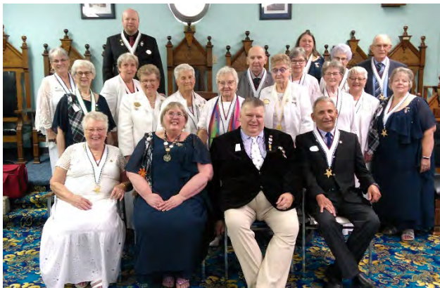
Official Visit with Prince Albert Officers and the Worthy Grand Matron and Worthy Grand Patron