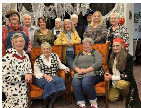
The Costume Party