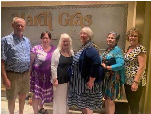
Service Dogs Cruise