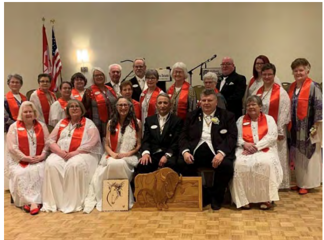
Grand Family 2022-23 taken at Grand Chapter 2023

Since the vote to amalgamate with Saskatoon #4, amalgamation plans are proceeding. The official amalgamation ceremony should take place early in the New Year.