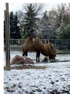
Zoo in the Snow