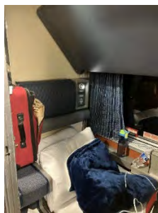
Sister Cheri's sleeper

The following photographs are from our journey. Angela drove to her Mom's the week before, so she missed the storm. Sister Cheri booked a sleeper car on the train out of Wolfe Point. It was 13 hours late arriving in Fargo, but the scenery was fantastic and so was the nap time. I met so many interesting people on the train as food and beverages were included in the cost of the ticket. I would definitely travel by train again.