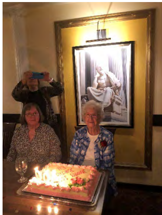
The Birthday Girl Herself!