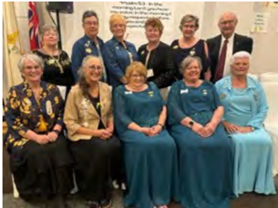
Saskatchewan Eastern Star Members at Manitoba Grand Chapter