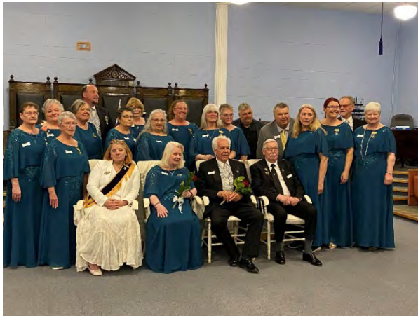
The 2024 Grand Chapter officers' team who attended Regal Chapter No. 132 Official Visit on May 13.