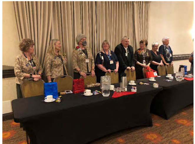
Head Table, Honours Luncheon for GGCCM Members