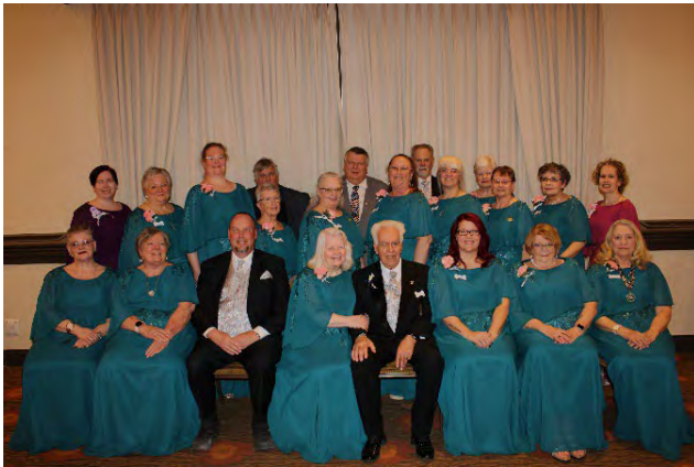
2024 Saskatchewan Grand Chapter Officers

We wish them all a wonderful and harmonious Grand Chapter Year.