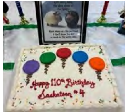
Happy Birthday, Saskatoon #4!

We enjoyed our Birthday cake and ice cream at the April meeting and did our share in celebrating a long existence together.