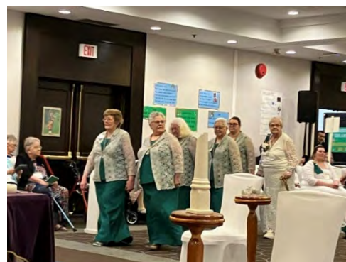
Manitoba Grand Chapter Officers