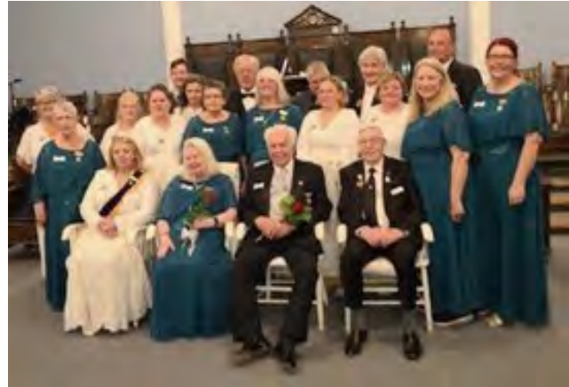
Official Visit of the WGM and WGP with Grand Officers and Regal #132 Officers