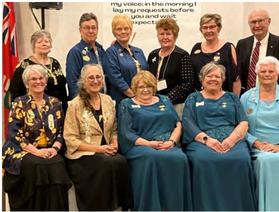
Saskatchewan Members attending Manitoba Grand Chapter