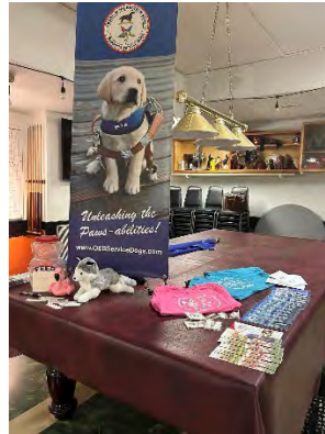
Service Dogs Display